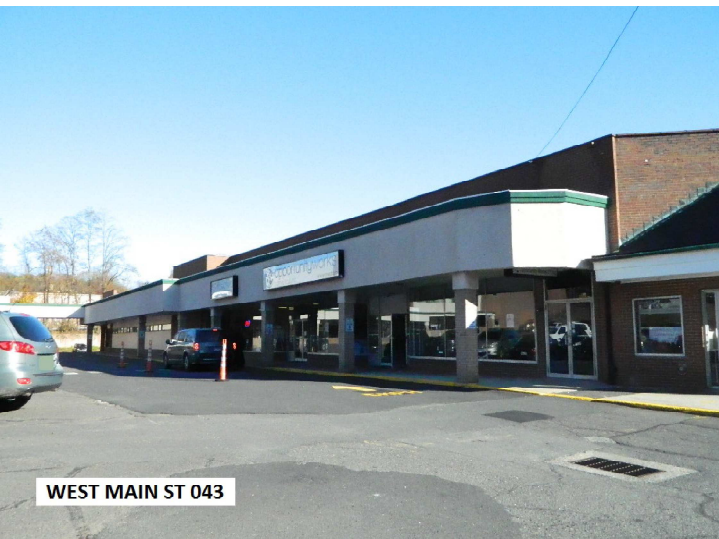
WEST MAIN ST 043