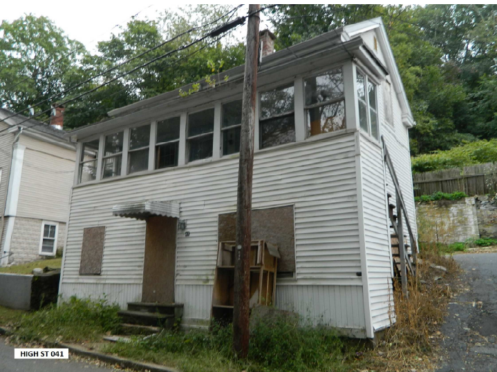
HIGH ST 041